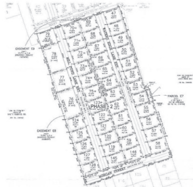
Storm Water Retention Pond - Phase 2

Additional information can be obtained at Cornwall Town Hall (39 Lowther Drive) during regular business hours or by visiting the Town website at www.cornwallpe.ca .