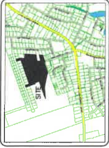
KEY PLAN 1:500